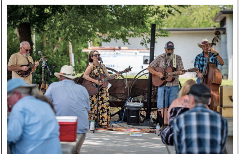
The band Gypsy Twang from Tulsa